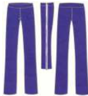
3001 zip bootleg pant $75.05