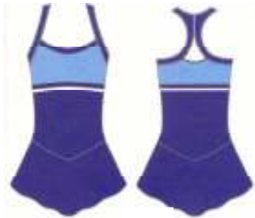
2088 Jacy $103.55