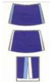
3020 Color Block Skirt $42.75