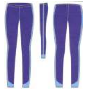
3052 side cuff legging $65.55

Attention: All sales are final. Refer to the measurement charts and measure carefully. All items will be designed using the Arctic Figure Skating Club colors. Sizing charts are attached. Refer to website http://www.jumpnstyleskatewear.com for further questions.