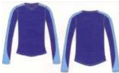
3203 cuff ls v-neck $32.25