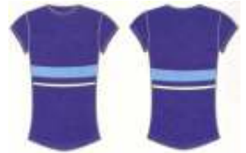
3207 Round Neck-T w/ Design Lines $38.00