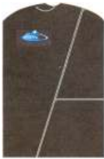
1001 Garment bag w/embroidery $44.65 w/out embroidery $38.00